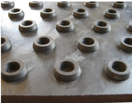
↑ Circular Studded bottom