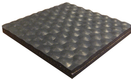
↑ Hammer Top side